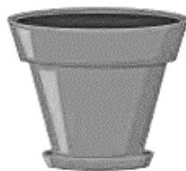
In a flower pot