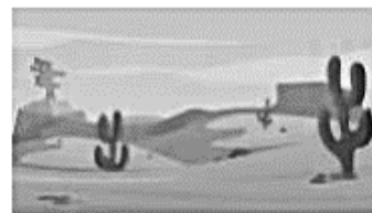
In the desert