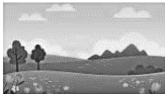
In a field