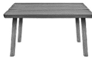
On a table