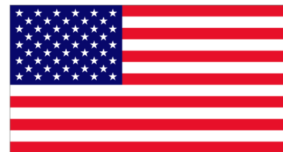
United States of America